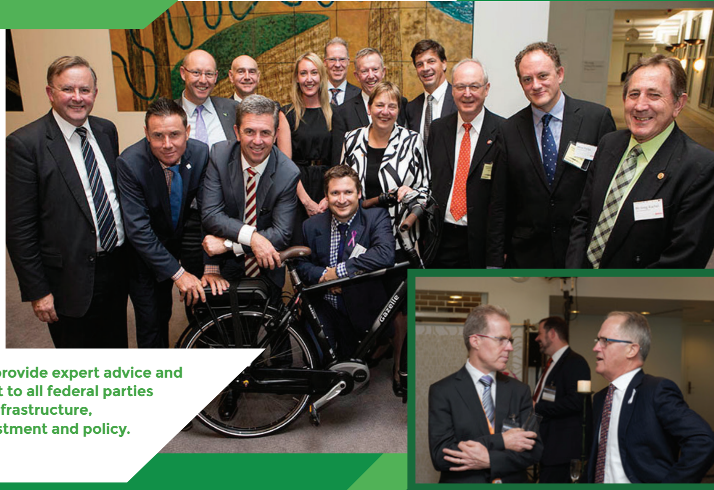
Parliament House with politicians

We provide expert advice and input to all federal parties on infrastructure, investment and policy.