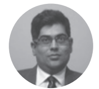
Neelesh Mehta Bike Corp