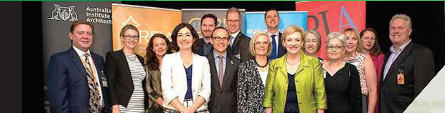
co-chairs of better cities together

The relationships and partnerships the CPF has fostered since its inception are critical to achieving greater investment and policies that promote bike riding across Australia.