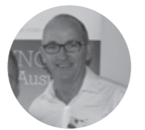
Jamie Walsh Adventure Brands