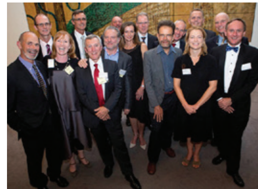
Australian bicycle advocacy leaders at the Summit dinner.